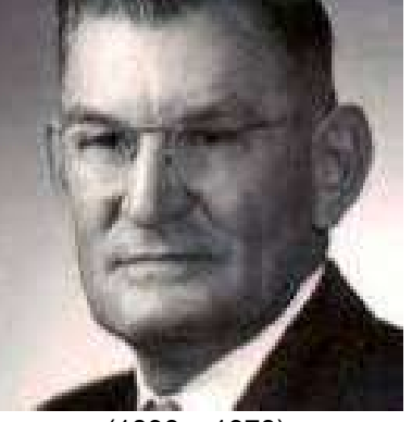
(1898 – 1978)

"Let the elders that rule well be counted worthy of double honour, especially they who labour in the word and doctrine. For the scripture saith, Thou shalt not muzzle the ox that treadeth out the corn. And, The labourer is worthy of his reward." (I Tim. 5:17-18)