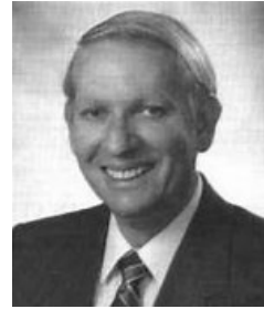
By Elder Guy Hunt (Deceased)

Morality is something we live by today, if we expect blessings and a clear conscience tomorrow. Immorality is of the devil and not of the Lord.