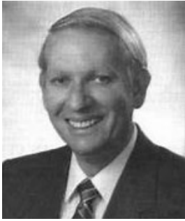
By Elder Guy Hunt (Deceased)

“And it came to pass, when Ahab saw Elijah, that Ahab said unto him, Art thou he that troubleth Israel? And he answered, I have not troubled Israel; but thou, and thy father's house, in that ye have forsaken the commandments of the LORD, and thou hast followed Baalim.” 1 st Kings 18:17-18