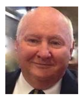
By Elder Bobby Willis (Deceased)

(From "The Primitive Baptist", April, 15, 1937) "...that the purpose of God according to election might stand."