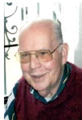
Farewell Vain World—I've Gone Home